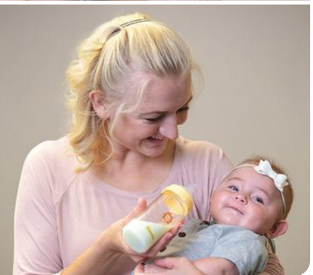
Tip 5: Let your baby pause and take breaks every few sucks. Your baby may feed for about 15–20 minutes.