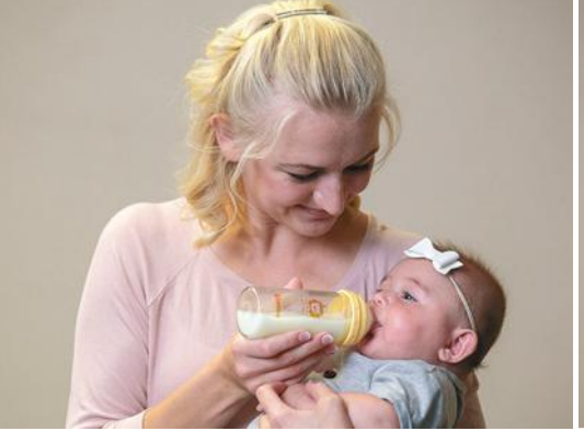
Tip 4: Hold the bottle in an almost flat position. This position keeps the formula or pumped milk from pouring into your baby's mouth. The nipple will fill and your baby will suck on the bottle.