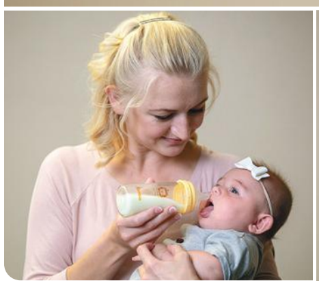
Tip 3: Brush the bottle nipple across your baby's upper lip. Wait for baby's mouth to open.